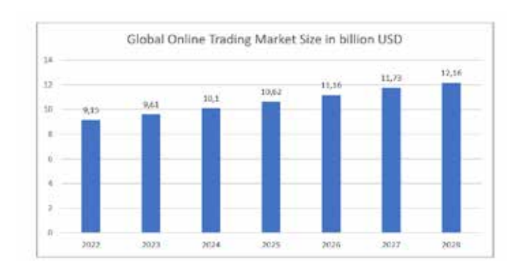
(Source: Statista, Global online trading market in 2020, with forecasts from 2021 to 2028 in billion U.S. dollars, https:// www.statista.com/statistics/1260026/forecast-global-onlinetrading-platform-market/ accessed 12 May 2022)

This staggering number urges trading services to engage technology to provide better services. That means the online applications will gradually replace the traditional broker. In the long run, another investment-related profession may also be affected. Since Notary is one of the professions that play a fundamental role in company establishment, its involvement in that matter can and may be replaced.